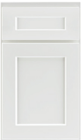
Nova MDF MDF - Frosty White