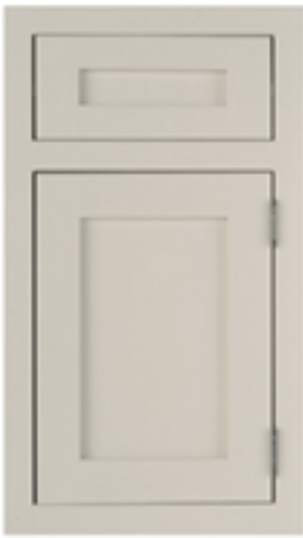
Shakertown II Oak - Antique White