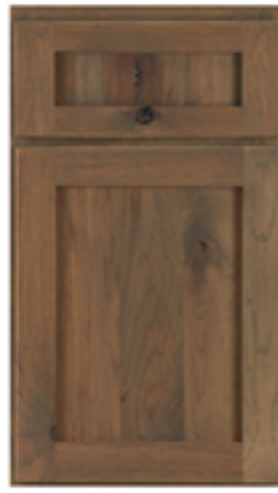
Shakertown IV Rustic Hickory - Boardwalk