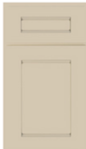
Ridgeland Maple - Crushed Ice *