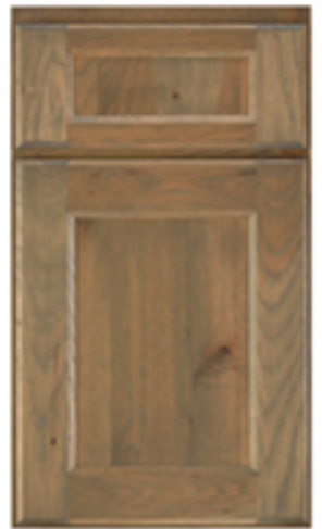
Ashton Grande Rustic Hickory - Cobblestone