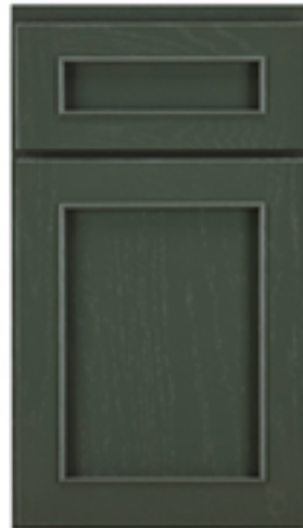
Newport Oak - Pewter Green