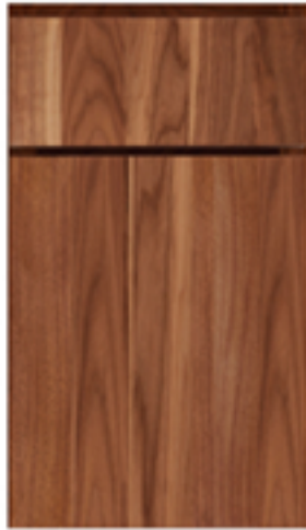
Linga Walnut - Natural