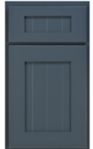
Trenton-3 Grande Maple - Harbor