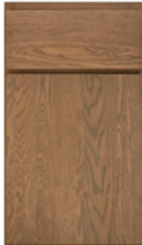
Bradford Oak - Heirloom