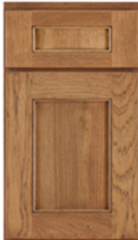
Nantucket Grande Hickory - Canyon