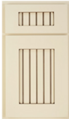
Trenton Grande Maple - Antique White*