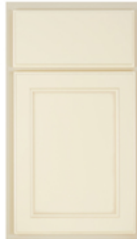
Brockton Maple - Cotton