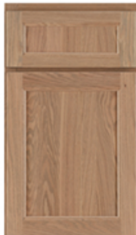
Woodbridge Oak - Sheer Mist