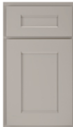
Highland Maple - Graystone