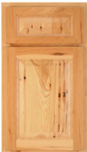
Charleston Rustic Hickory - Natural