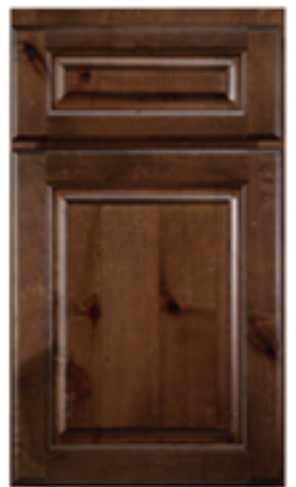
Independence Rustic Alder - Java