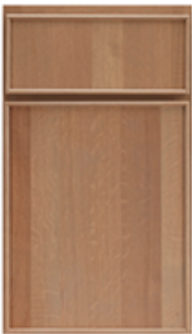
Urban Quarter Sawn White Oak - Sheer Mist