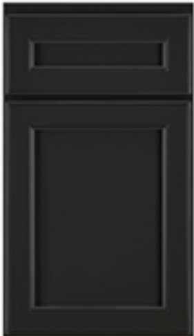
Aurora Maple - Iron Ore