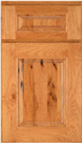
Independence Grande Rustic Hickory - Heirloom