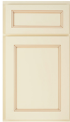
Mendota Maple - Cotton *