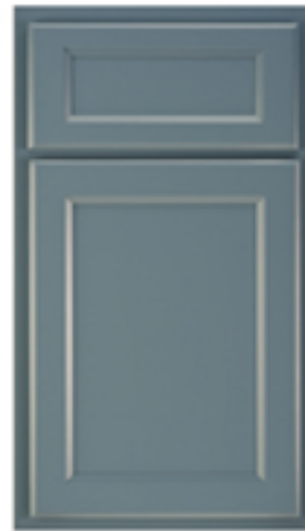
Ashton Maple - Smoky Blue