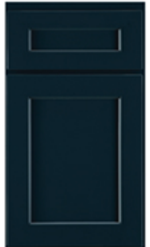
Brockton Grande Maple - Dark Night