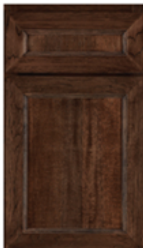
Pennington Hickory - Mocha