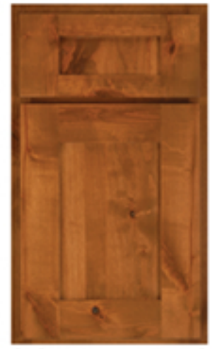
Shakertown IV Grande Rustic Alder - Heirloom