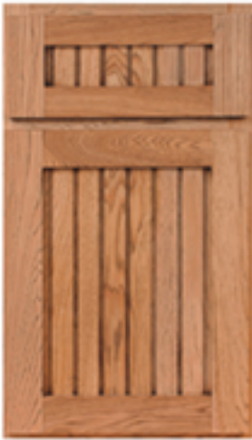
Trenton Hickory - Natural*