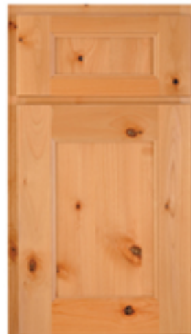
Woodbridge Grande Rustic Alder - Natural