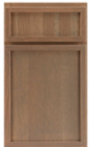
Salerno Rift Sawn White Oak - Boardwalk