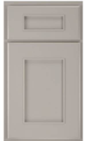
Newport Grande Maple - Graystone