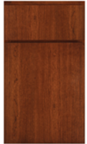
Metro Cherry - Hazelnut