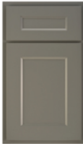
Arlington Grande Maple - Slate