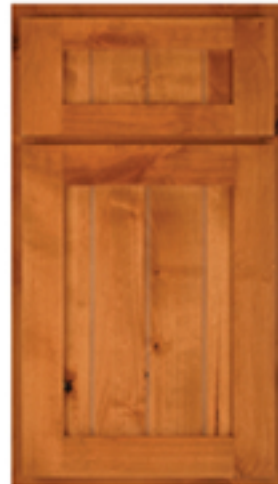
Trenton-3 Rustic Alder - Wheat