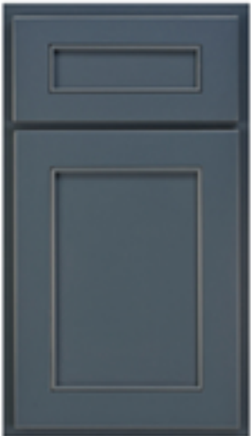
Nantucket Maple - Harbor