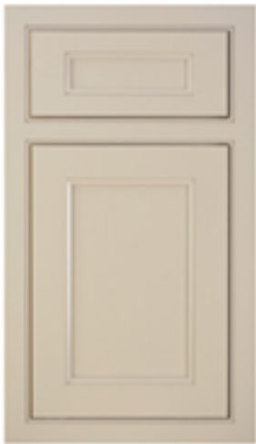
Arlington Maple - Crushed Ice