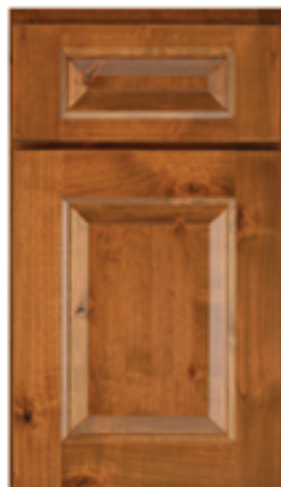
Charleston Grande Rustic Alder - Heirloom