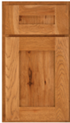
Shakertown II Grande Rustic Hickory - Heirloom